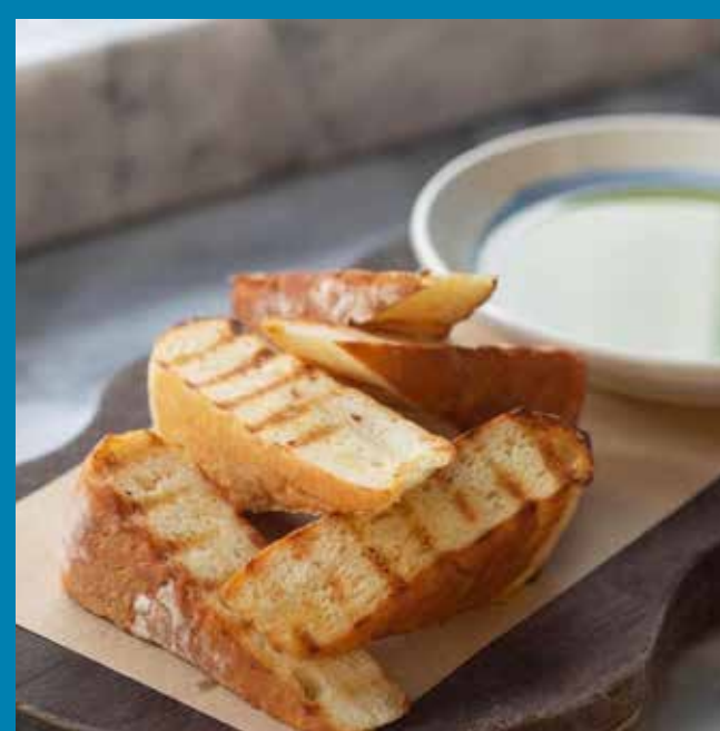
Housemade sliced bread & Planeta Extra Virgin Oil 140