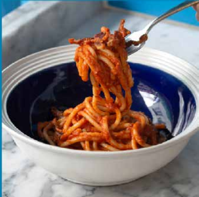
Amatriciana (Bucatini or Rigatoni) 390