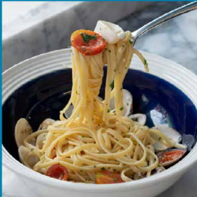
Vongole e Moscardini (Linguine or Paccheri) 390