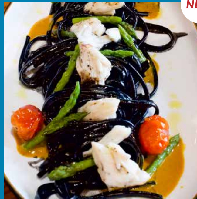
Black ink spaghetti, fresh crab meat, green asparagus & saffron bisque 990