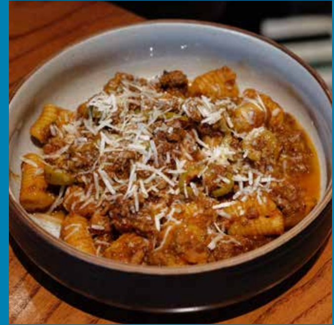
Saffron Gnocchetti & baby lamb ragù 440