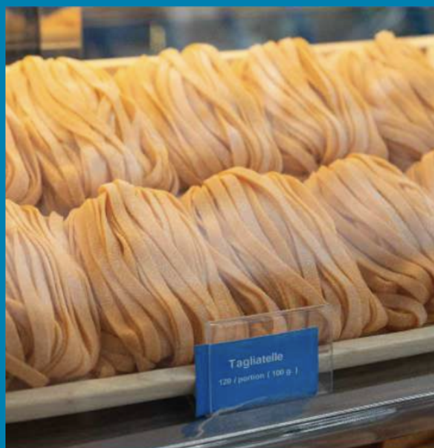
Tagliatelle (fresh pasta - 100 g) 140