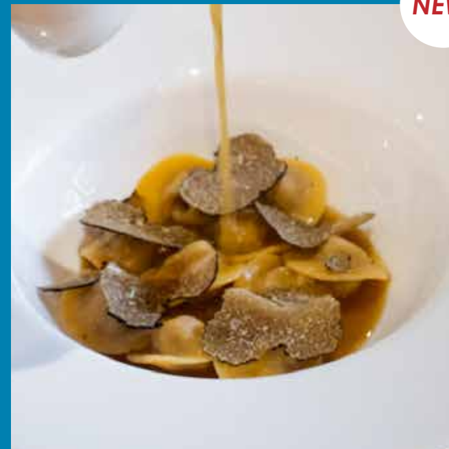
Handmade guinea fowl Cappelletti