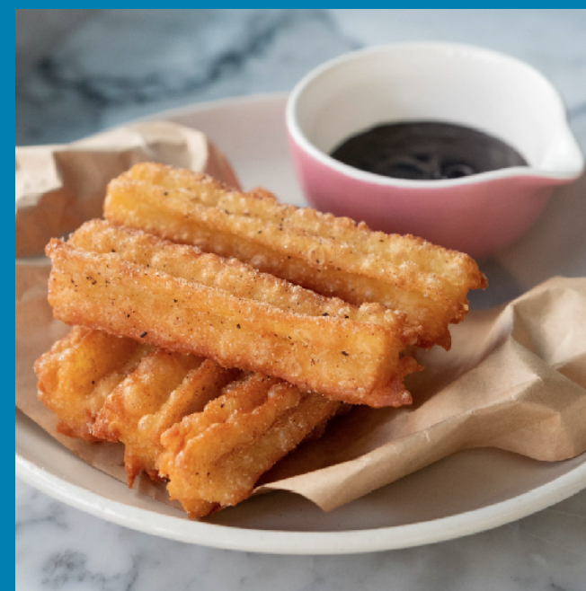
Churros with Couverture chocolate 240