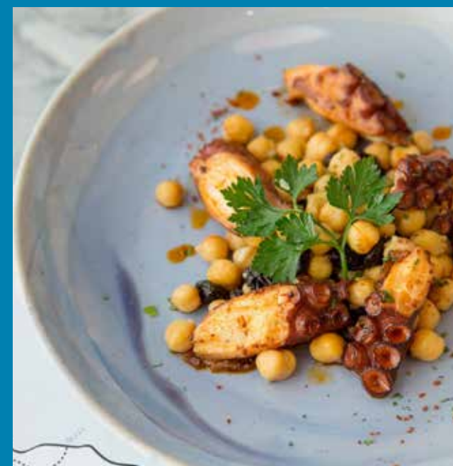
Grilled Spanish octopus tentacle 790

* Price is subject to govt. tax * Delivery fee is excluded * Please allow our service team to reconfirm your order as some items might not be available