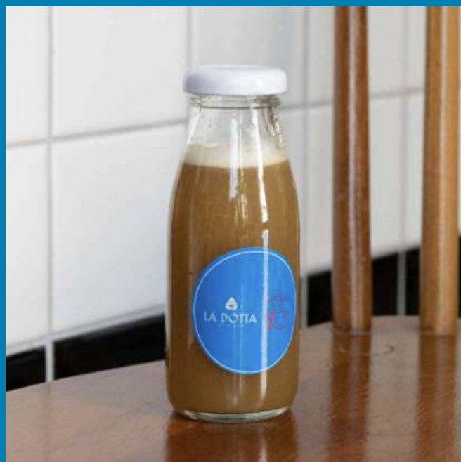
Lemon mint / White grapefruit / Valencia orange 120