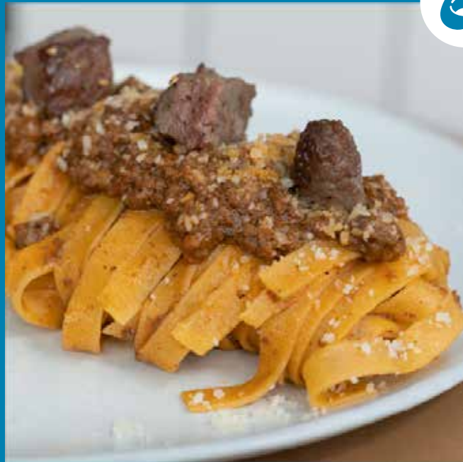
Tagliatelle Wagyu Bolognese 690