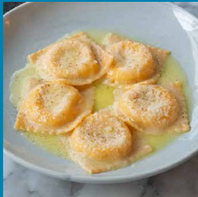
Burrata Ravioli 490 Add Italian black truffle 1 gram (190)