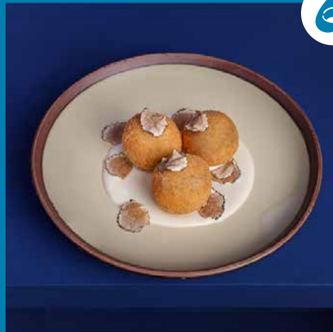
Truffle, sage & Ricotta deep fried balls 320