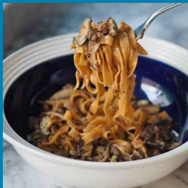
Tagliatelle alla Montanara 390