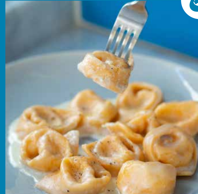
Tortelloni 4 cheese 390 Add Italian black truffle 1 gram (190)