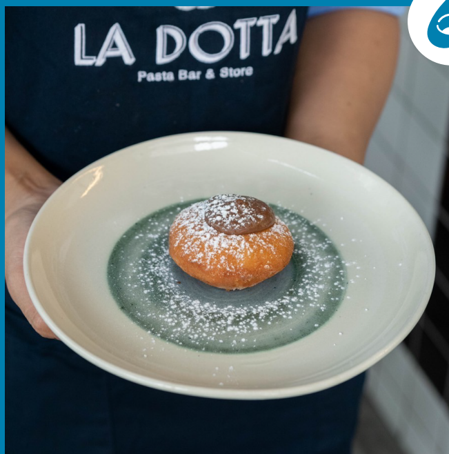
Nutella Bomboloni 140