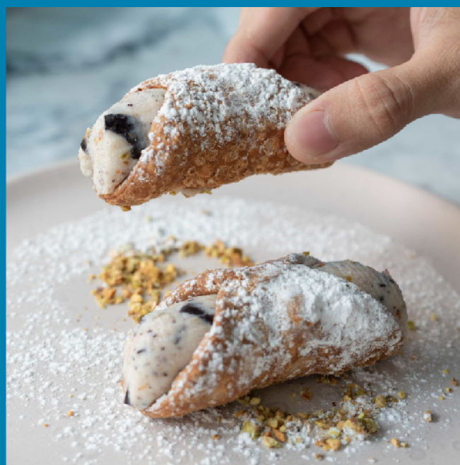
Sicilian Cannoli 290