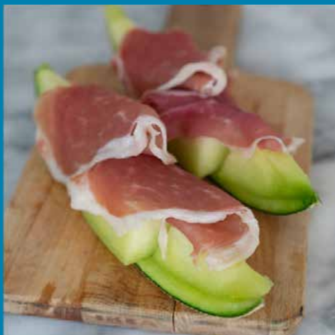
22-months aged Parma ham & winter melon 420