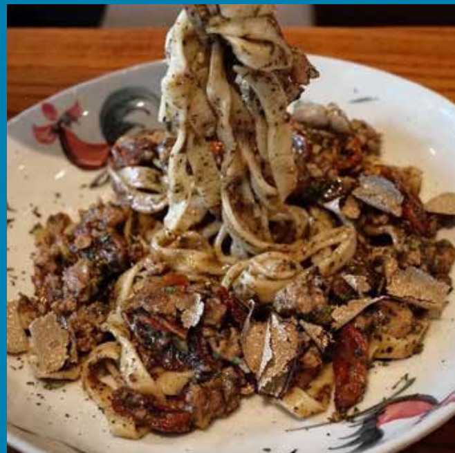
Stringozzi with pork ragù & black truffle