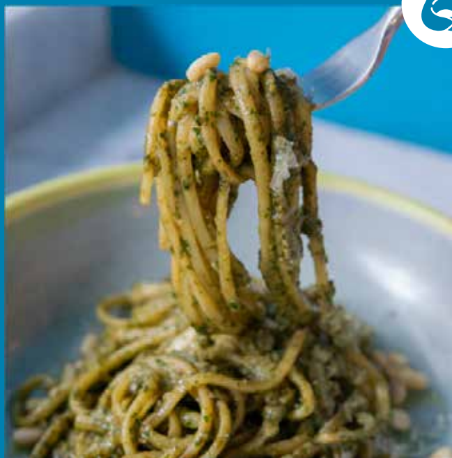
Pesto "alla Genovese" (Casarecce or Linguine) 390