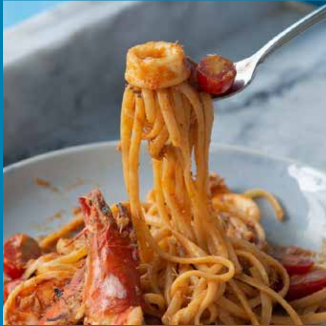
Spaghetti 'allo Scoglio' 690