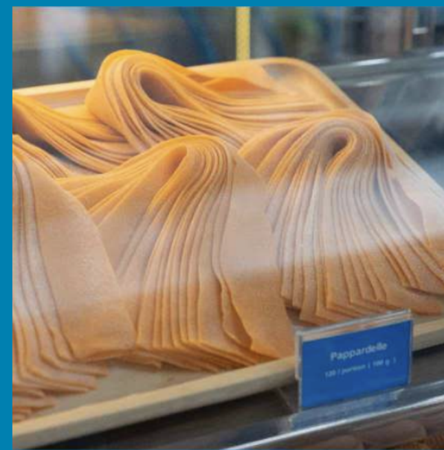
Pappardelle (fresh pasta - 100 g) 140