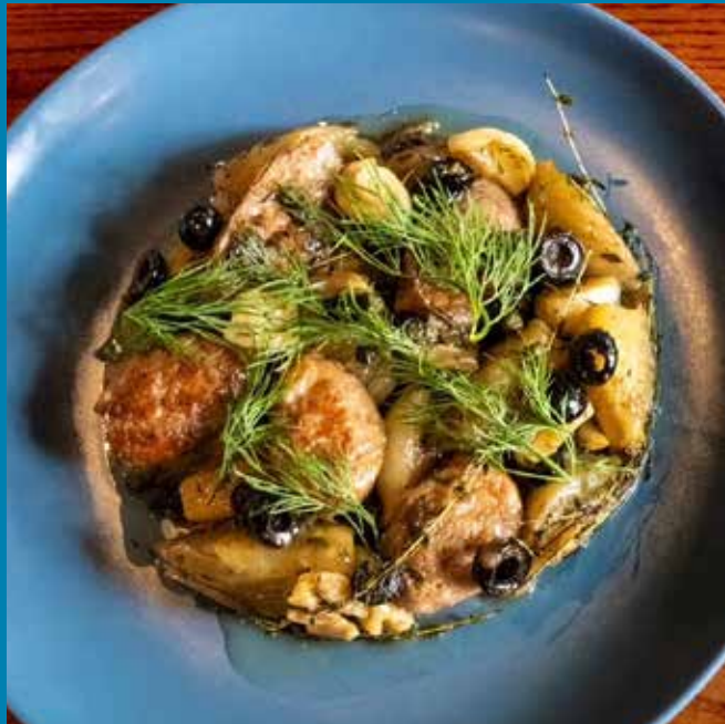
Salsiccia al Finocchio 590