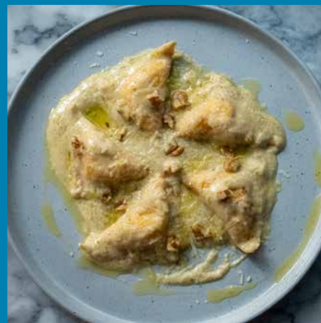
Pansotti con Salsa di Noci 390

* Price is subject to govt. tax * Delivery fee is excluded