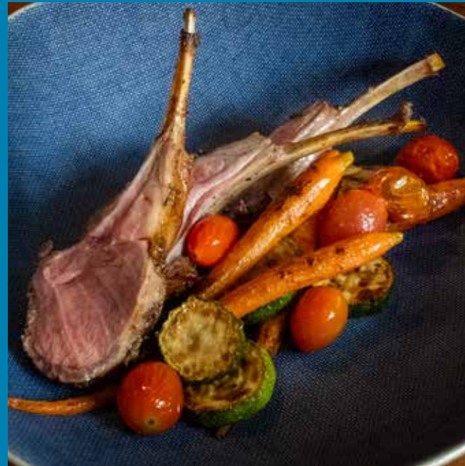
Baby lamb chops, lavender & honey servd with mixed grilled vegetables 1,190