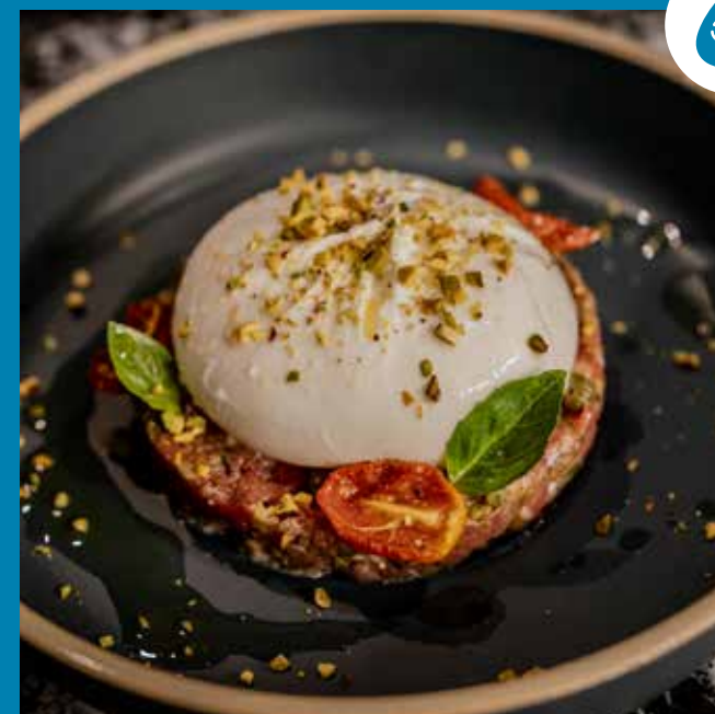
Australian Wagyu Tartare & fresh Burrata with capers & pistachios 840