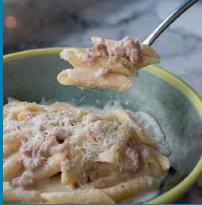
Pennette with pork sausage 320