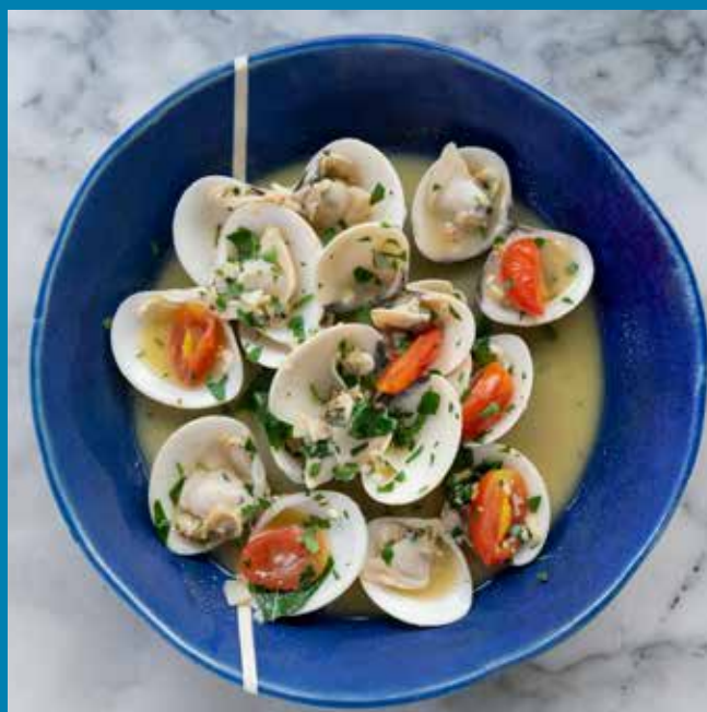
Clams sautéed in white wine & garlic sauce 290