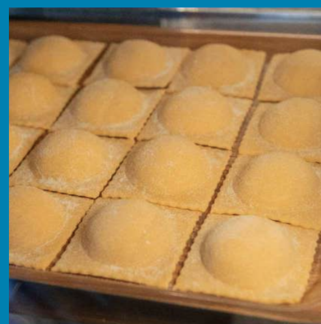
Burrata Ravioli (fresh pasta - 5 pcs) 340

* Price is subject to govt. tax * Delivery fee is excluded