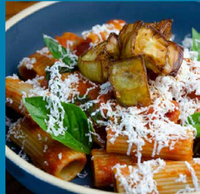
Rigatoni alla Norma 290