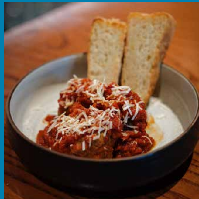
Lamb meatballs New Zealand lamb shoulder, lightly spicy tomatoes sauce & Pecorino Romano DOP 370

* Price is subject to govt. tax * Delivery fee is excluded * Please allow our service team to reconfirm your order as some items might not be available