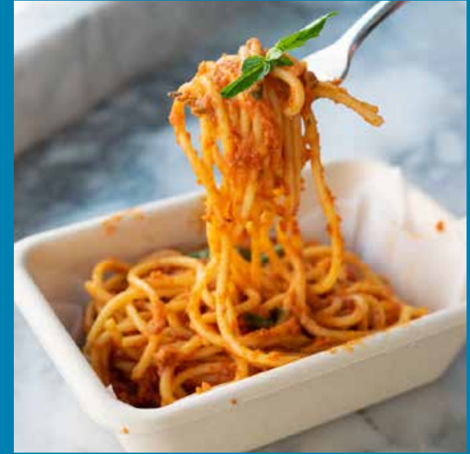
Spaghetti with tomatoes sauce 320