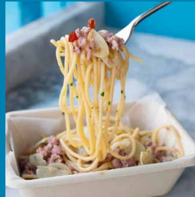
Spaghetti AOP with fresh sausage 320

* Price is subject to govt. tax * Delivery fee is excluded