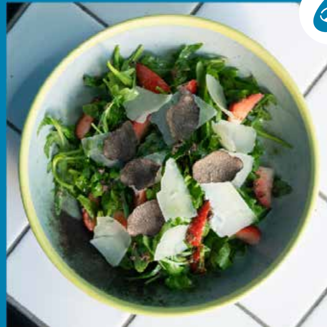
Strawberries & Italian black truffle with rocket salad & Parmigiano Reggiano 420