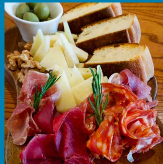
Chef Francesco's selection of premium Italian cold cuts & cheese 790

* Price is subject to govt. tax * Delivery fee is excluded