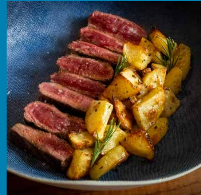
Australian Wagyu flank beef 'Tagliata' 890