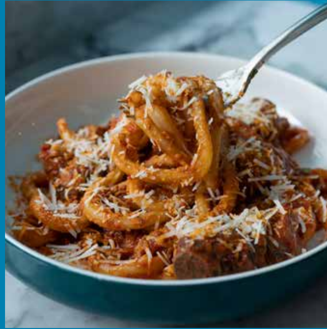
Pici pork ribs 520