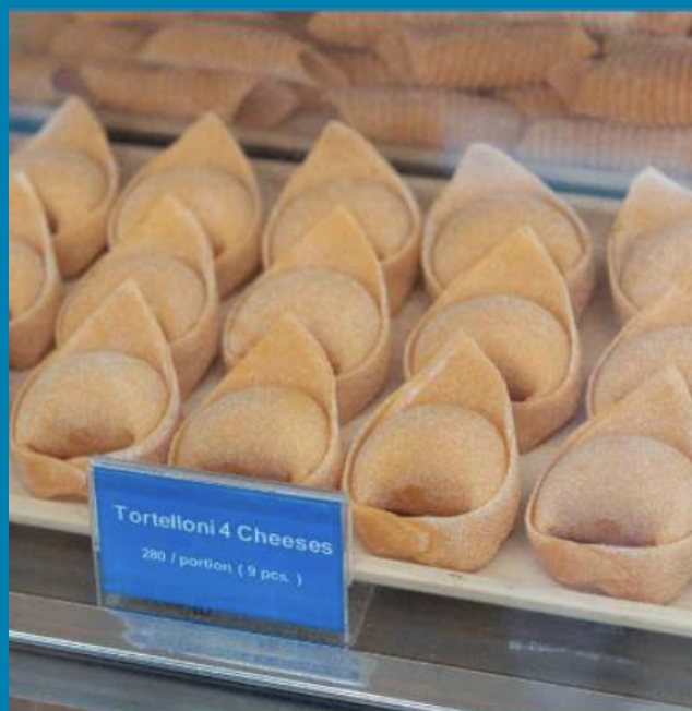
Tortelloni 4 cheeses (fresh pasta - 9 pcs) 340