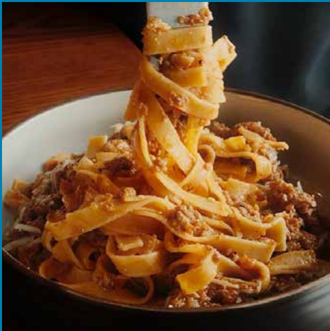
Tagliatelle duck ragù 390