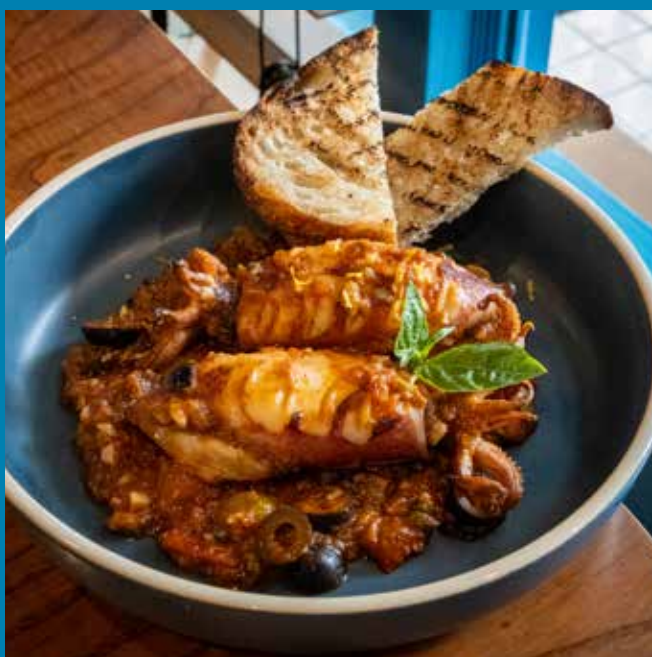
Grilled baby squid & Puttanesca sauce 490