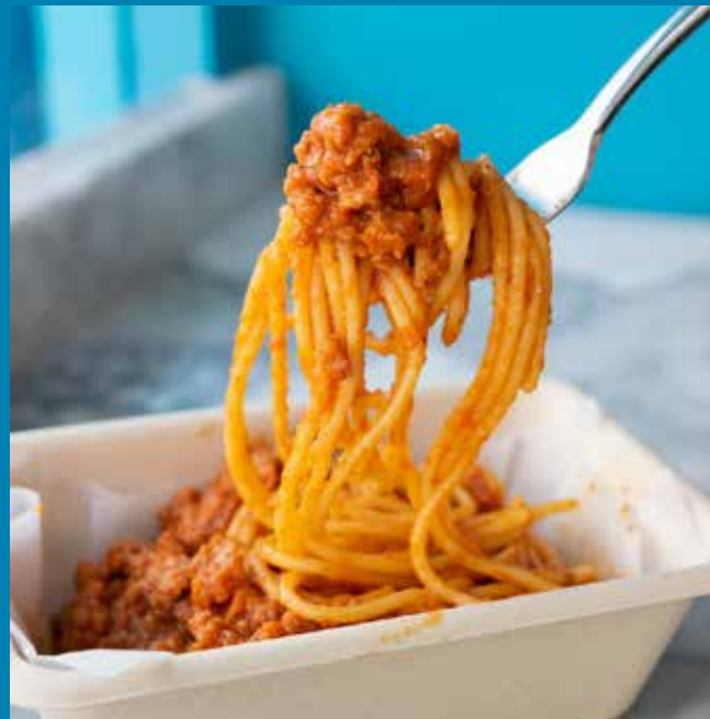
Spaghetti with pork sausage 320