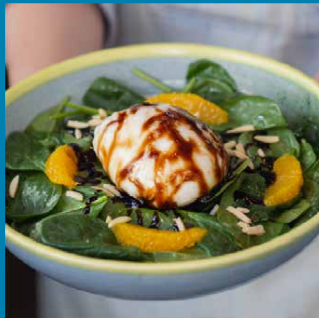
Fresh Burrata salad, honey, balsamico & baby spinach 560